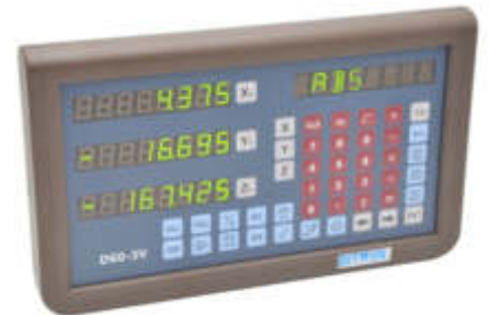
DRO 3 AXIS LATHE/MILLING