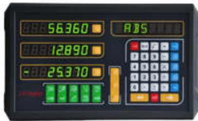
DRO 3 AXIS EDM