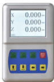
DRO 3 AXIS LCD