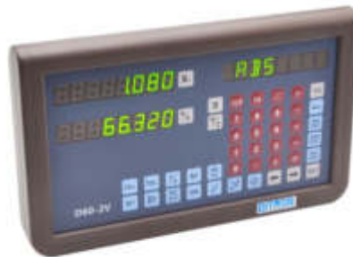
DRO 2 AXIS LATHE/MILLING