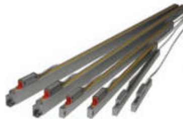
LINEAR GLASS SCALE